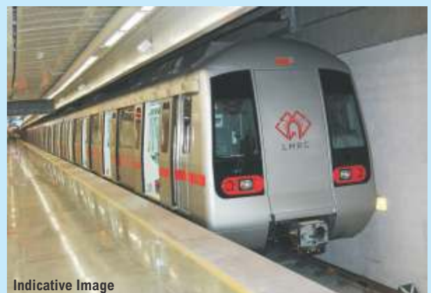
Upcoming Metro in the Vicinity