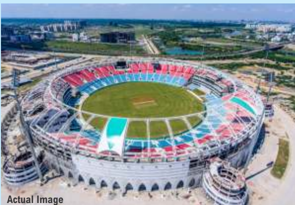
International Cricket Stadium